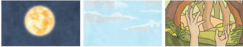
day one - heavens earth light

What are some ways Jewish people show their beliefs and how they belong?